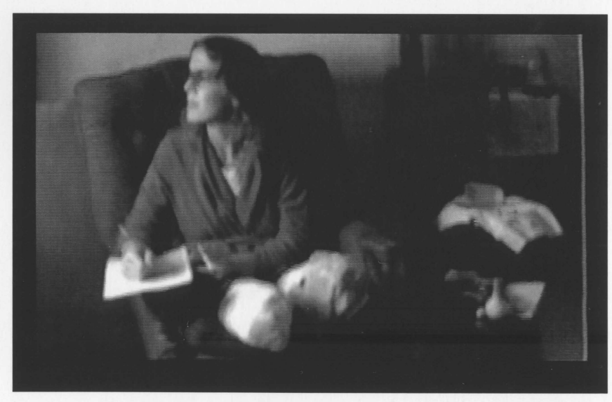
Screenshot from The Amputee (1974) directed by David Lynch

as Hegel remarks in the Phenomenology with respect to (not only) ancient Stoicism. As Hegel explains, this is because "[...] in the case of a representation [ Vorstellung ], [...] consciousness still has specially to bear in mind that this is its representation [ Vorstellung ]; on the contrary, the concept [ Begriff ] is for me straightaway my concept [ Begriff ]" (Hegel 1977, p. 120).<sup>42</sup> Disgust breaks up this rational self-communion. So besides veiling the self-implication of the moral subject into its object and besides blurring the distinction between pathological and moral compassion, disgust lastly makes it impossible even to discern whether the Pflichtvorstellung really is the subject's very own representation or not, and whether it is a representation of a concept or a representation in the sensuous, aesthetic sense.